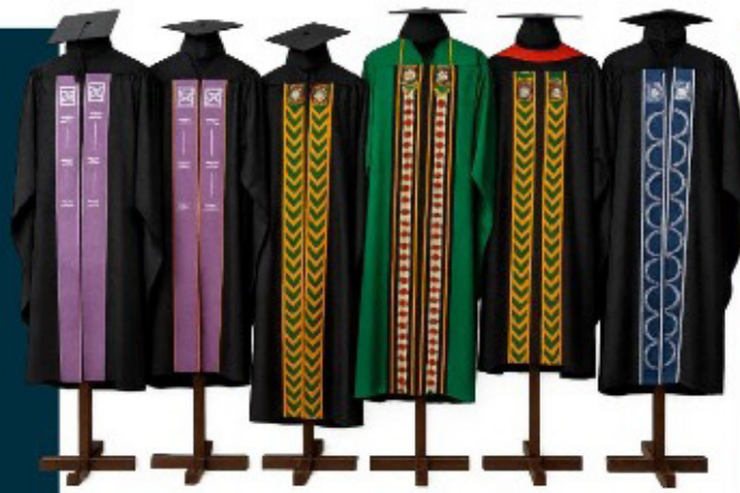
SOME OF OUR CLIENTS

For over 30 years Cum Laude has designed and manufactured world-class academic attire tailored for top universities, legal institutions and ceremonial leaders. Cum Laude has serviced the same sectors in Zambia for the past 15 years.