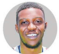
Muma Mucheleka Minister of Sports & Health