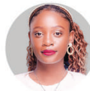
Katendi Kalwizhi Prime Minister