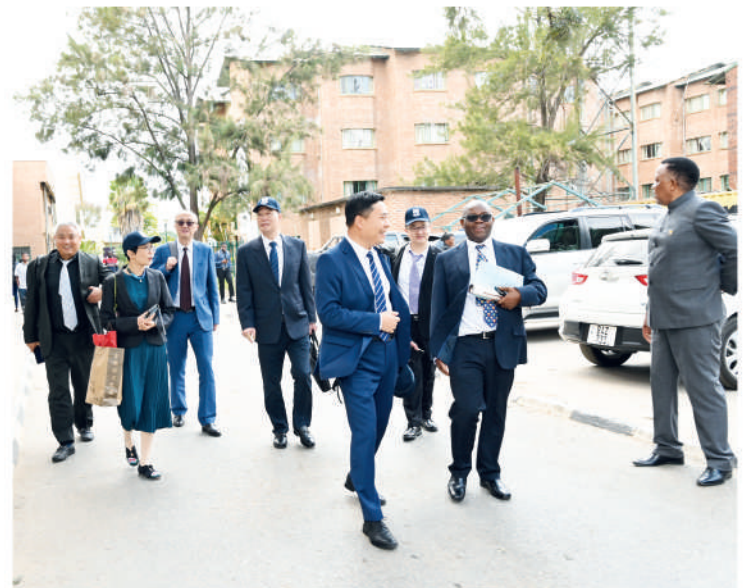
An MoU with Hubei University of Technology, China to facilitate improved quality of study programmes as well as capacity building for staff and student exchange programmes.