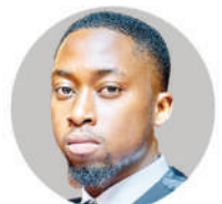
Tanatswa Paswani Minister of Social, Cultural, Religion and Mobilisation