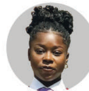
Rhoda Makaliki Minister of Finance