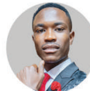
O'Brian Mabandla Minister of Foreign Affairs