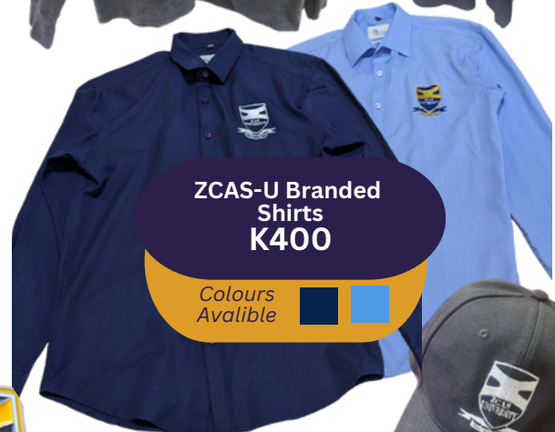
ZCAS-U Branded Shirts K400

Orders can be made through Newton at newton.daka@zcasu.edu.zm or call +260976 609 616