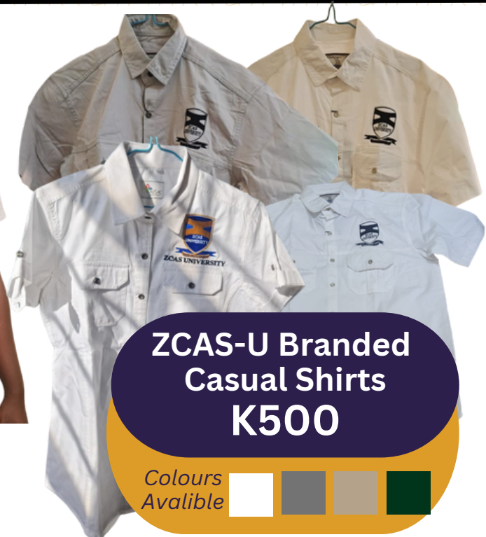
ZCAS-U Branded Casual Shirts K500