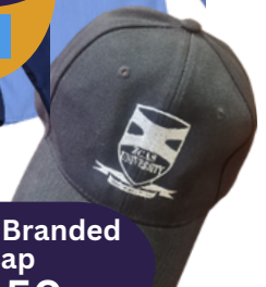
ZCAS-U Branded Cap K150