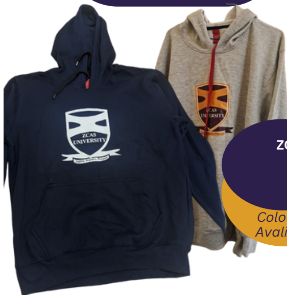
ZCAS-U Branded hoodies K500