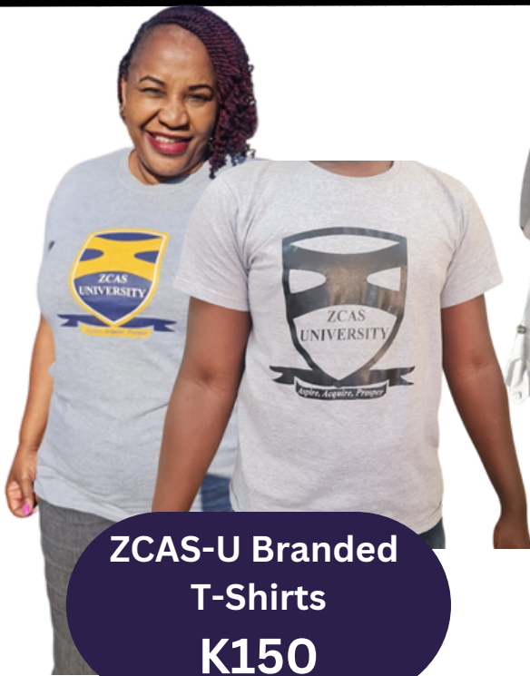
ZCAS-U Branded T-Shirts K150