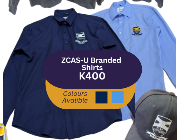
ZCAS-U Branded Shirts K400 Colours Available

Make your orders today and rock in the ZCAS-U swagger Orders can be made through Newton at newton.daka@zcasu.edu.zm or call +260976 609 616