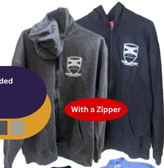
With a Zipper

Make your orders today and rock in the ZCAS-U swagger Orders can be made through Newton at newton.daka@zcasu.edu.zm or call +260976 609 616