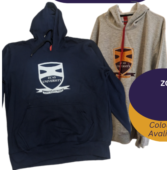
ZCAS-U Branded hoodies K500 Colours Available