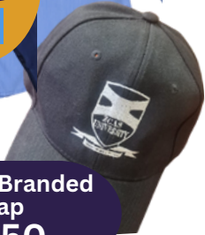
ZCAS-U Branded Cap K150