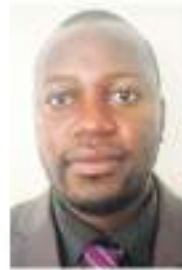
Dean School of Computing Technology and Applied Sciences